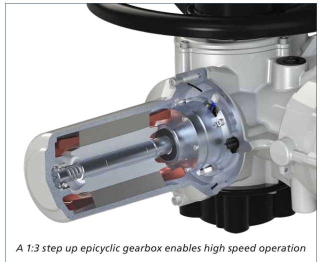
A 1:3 step up epicyclic gearbox enables high speed operation

IQH actuators have been developed for diverter valves in meter prover applications that require fast operation with positive seating and zero backdriving.